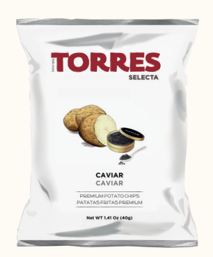
Torres Selecta Caviar Potato Chips